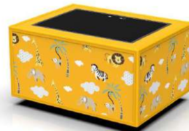
保温黄色儿童布菲车/Kids Buffet Station