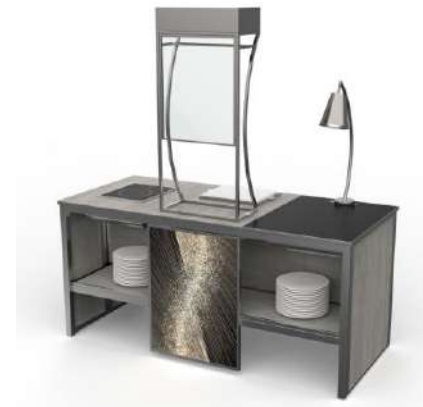
烤鸭车/Peking Duck Station