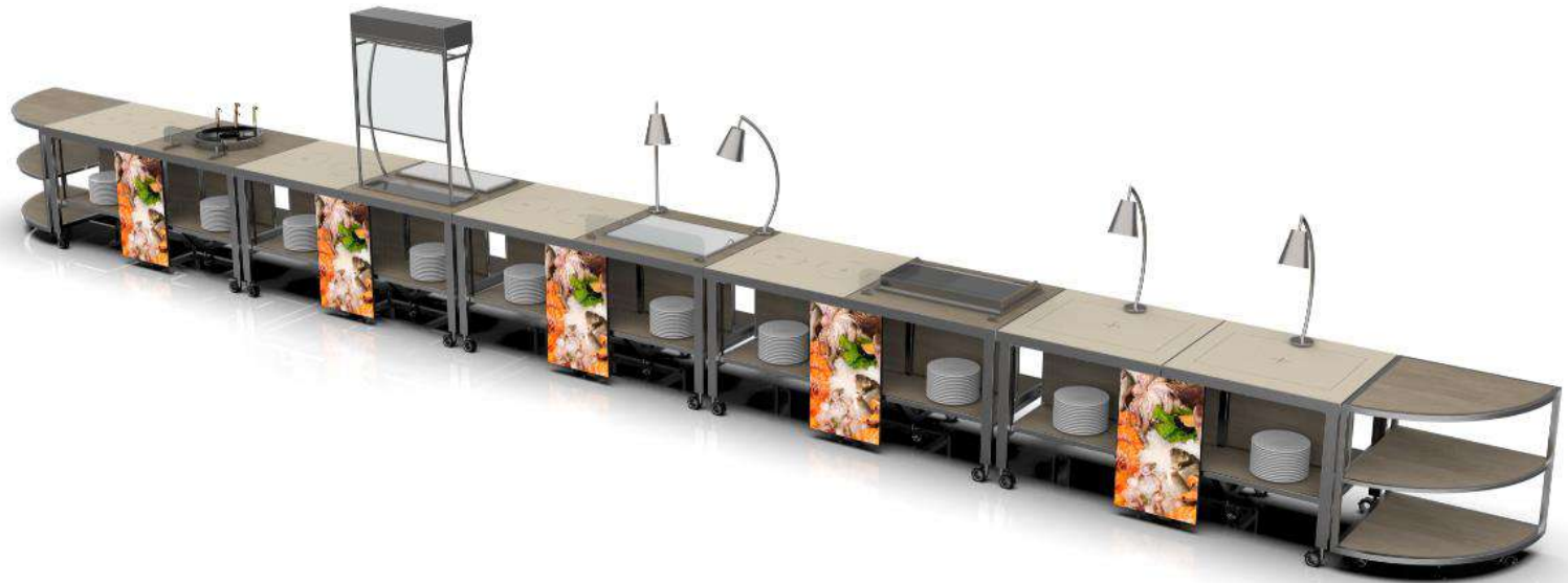
布菲车组合图三/ Buffet Station Combination