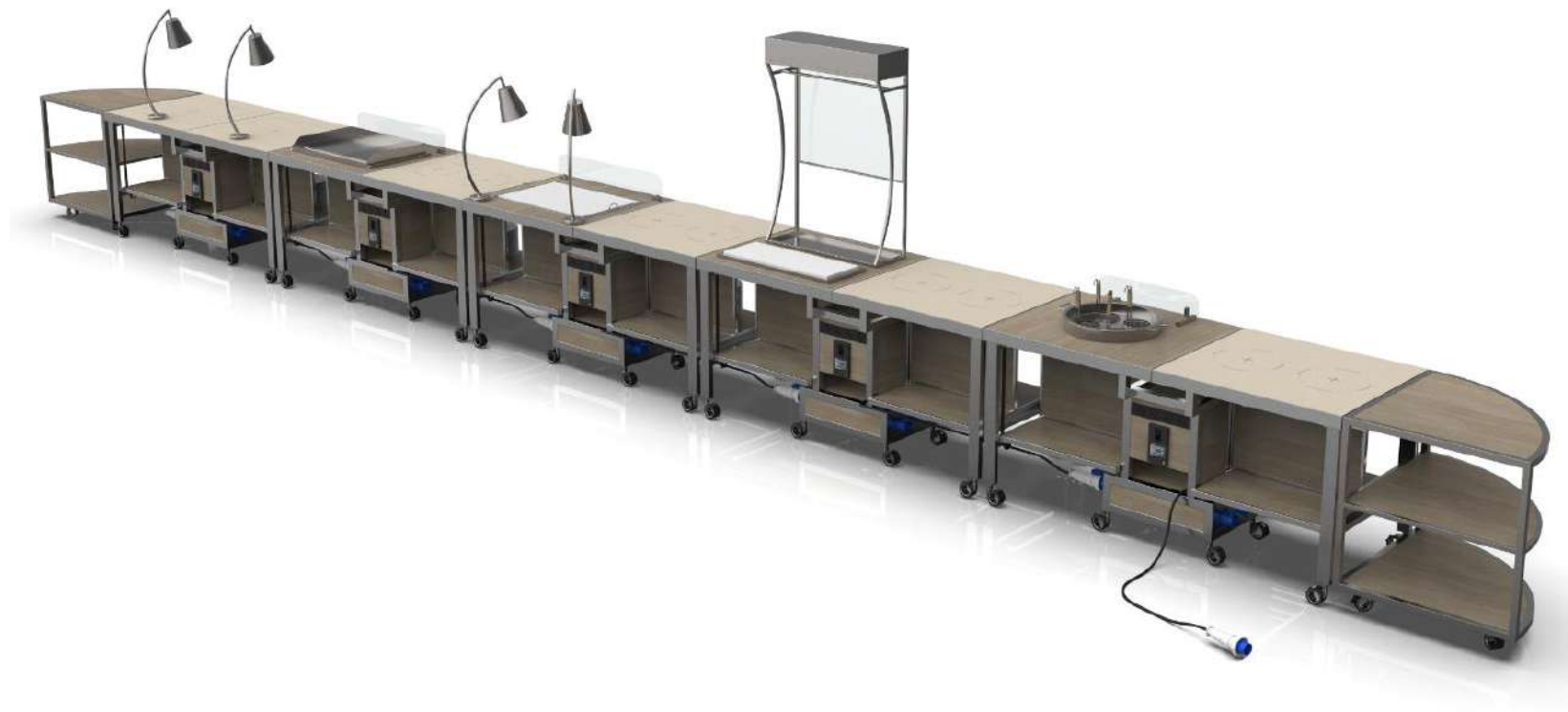
布菲车电源线连接图/ Buffet Station Electric Control Chart