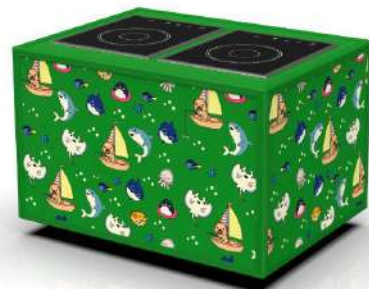
电磁炉绿色儿童布菲车/Kids Buffet Station