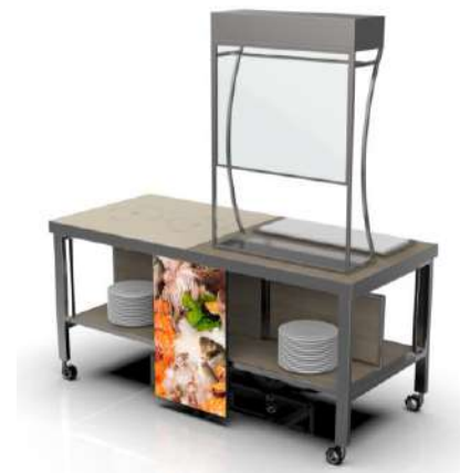
烤鸭车/Peking Duck Station