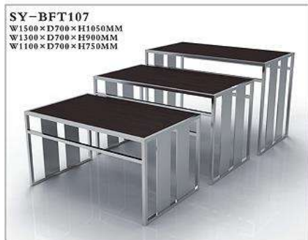
SY-BFT107 W1500×D700×H1050MM W1300×D700×H900MM W1100×D700×H750MM