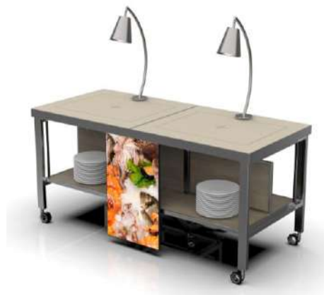
电热保温车/Heating Plate Station