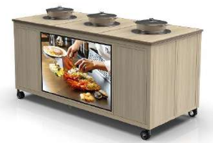
汤炉保温车/Soup Wamer Station