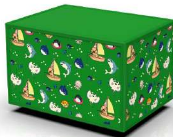
绿色儿童布菲车/Kids Buffet Station