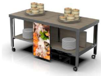
点心车/Dim Sum Station