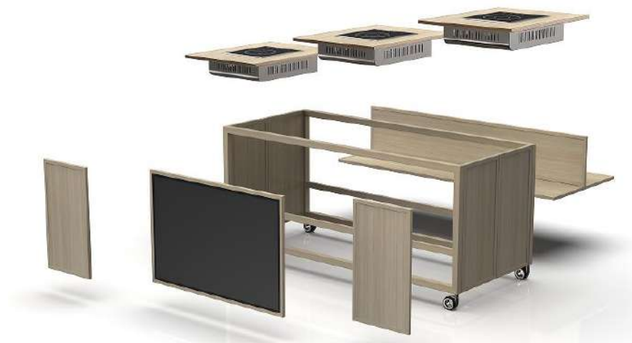
组合示意图/Schematic Diagram of Combination