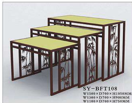
SY-BFT108 W1500×D700×H1050MM W1300×D700×H900MM W1100×D700×H750MM