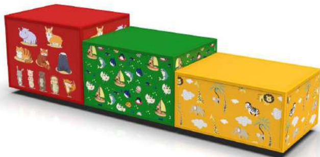
儿童布菲车组合图/Kids Buffet Station Combination