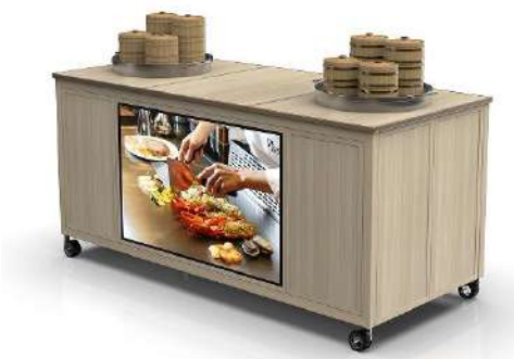
点心车/Dim Sum Station