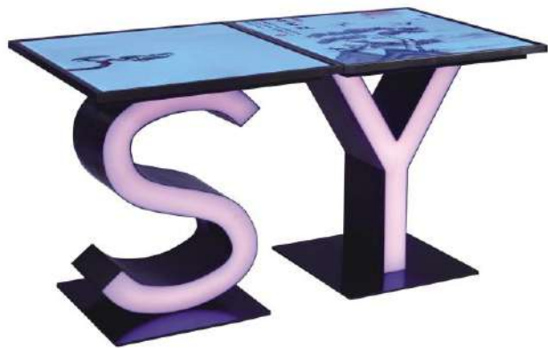
BFZT101 字 母布菲台