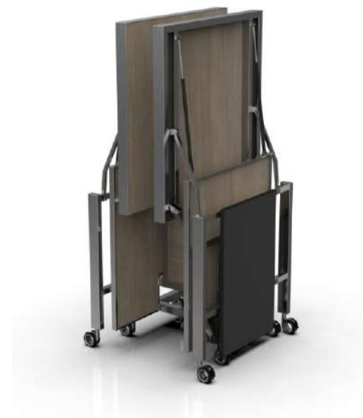
整车折叠/The Vehicle Folding