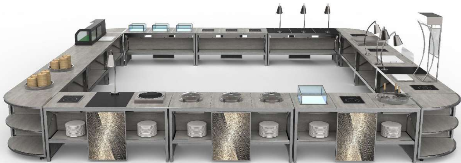
折叠布菲车组合图/ Buffet Station Combination