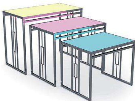
SY-BFT101 W1500×D700×H1050MM W1300×D700×H900MM W1100×D700×H750MM