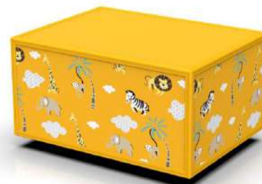
黄色儿童布菲车/Kids Buffet Station