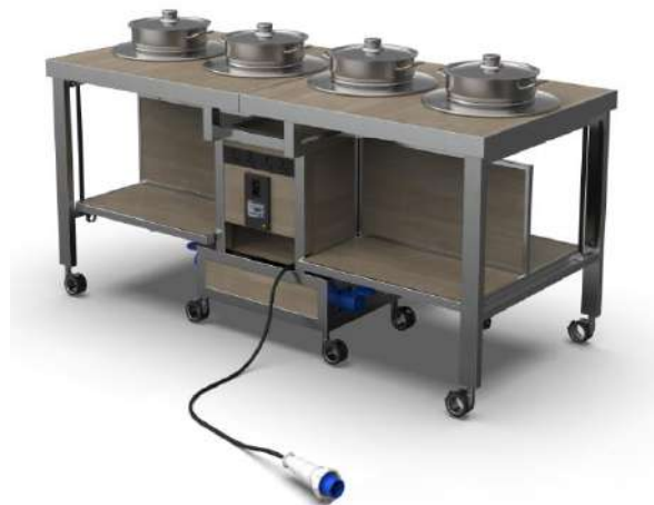
单车电控图/Electric Control Chart