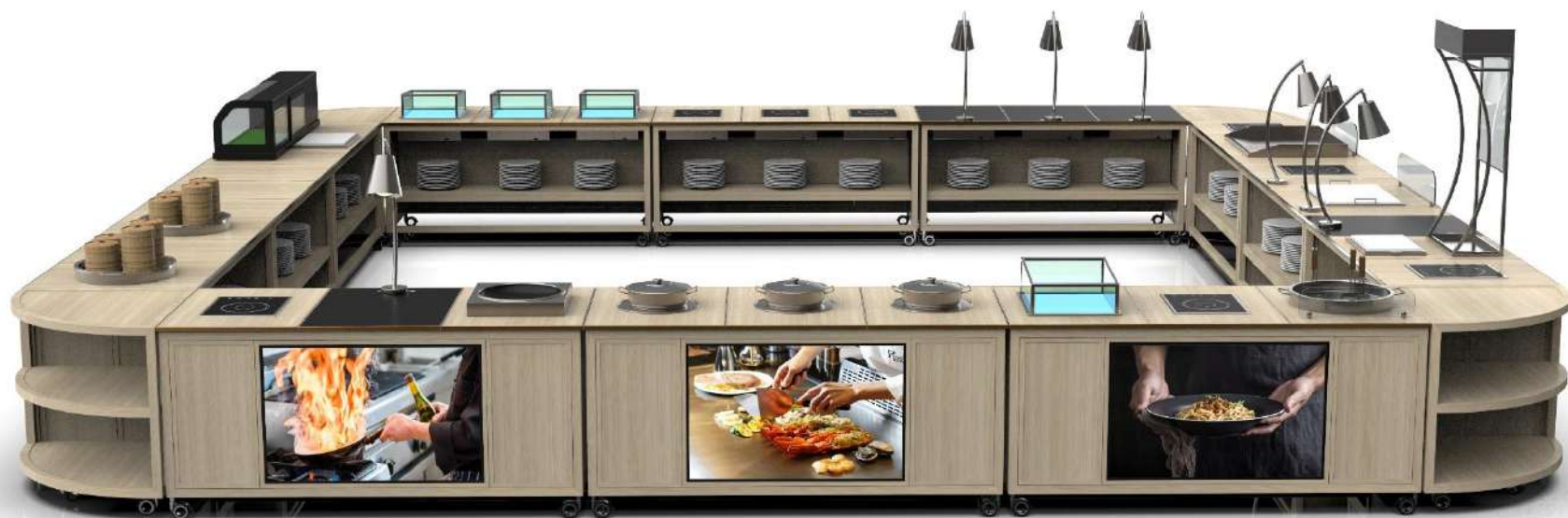
折叠布菲车组合图/ Buffet Station Combination