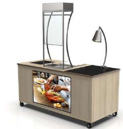
烤鸭车/Peking Duck Station