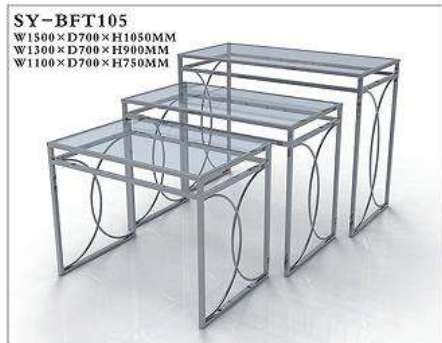
SY-BFT105 W1500×D700×H1050MM W1300×D700×H900MM W1100×D700×H750MM