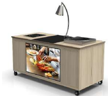
中式炒菜车/Chinese Cooking Station