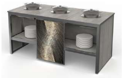
汤炉保温车/Soup Wamer Station