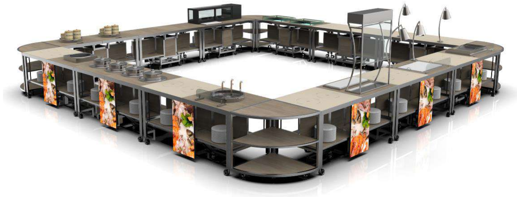
布菲车组合图一/ Buffet Station Combination