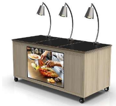
电热保温车/Heating Plate Station