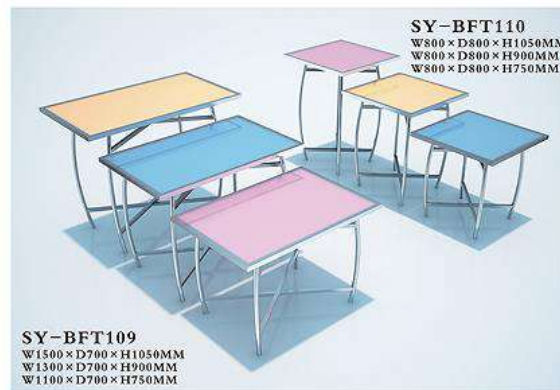
SY-BFT110 W800×D800×H1050MM W800×D800×H900MM W800×D800×H750MM