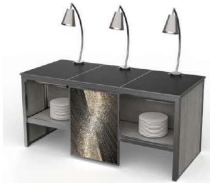
电热保温车/Heating Plate Station