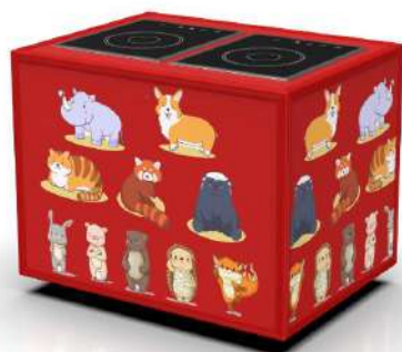
电磁炉红色儿童布菲车/Kids Buffet Station