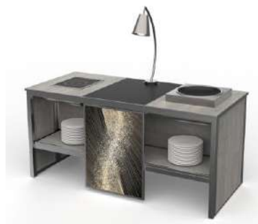
中式炒菜车/Chinese Cooking Station