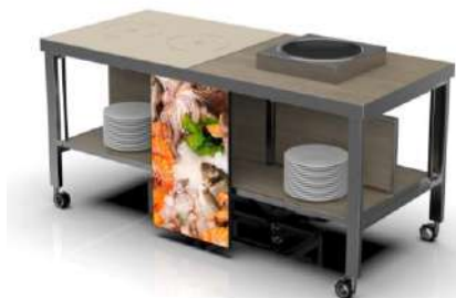
中式炒菜车/Chinese Cooking Station