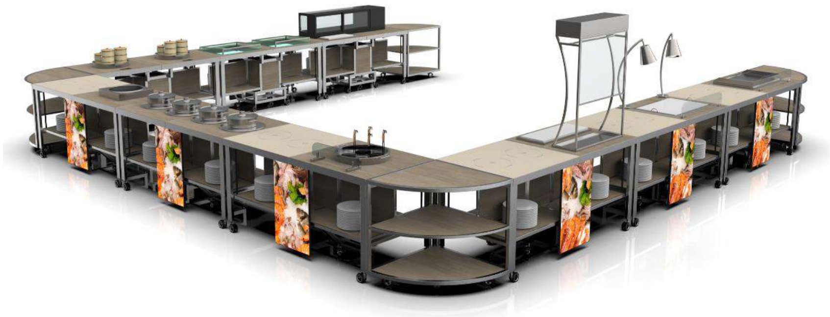
布菲车组合图二/ Buffet Station Combination