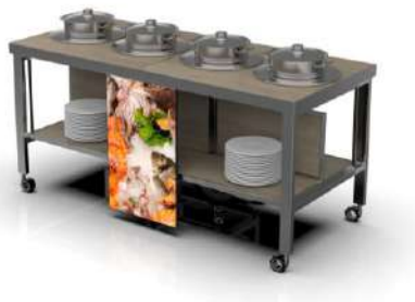
汤炉保温车/Soup Wamer Station