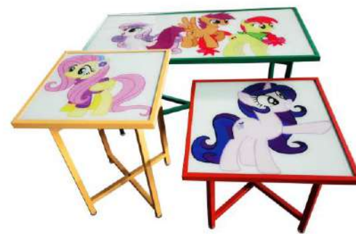
儿童布菲台组合/Kids Buffet Table Combination