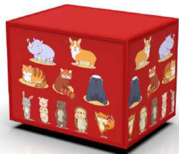
红色儿童布菲车/Kids Buffet Station