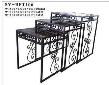
SY-BFT106 W1500×D700×H1050MM W1300×D700×H900MM W1100×D700×H750MM