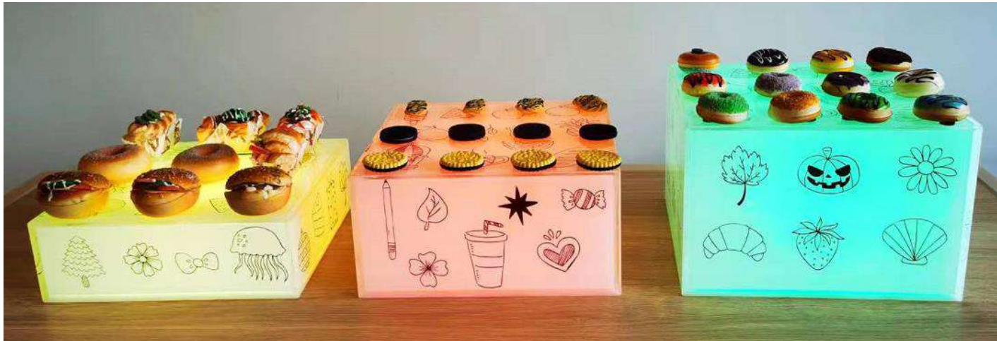
TM101 300*300*H150 300*300*H200 300*300*H250