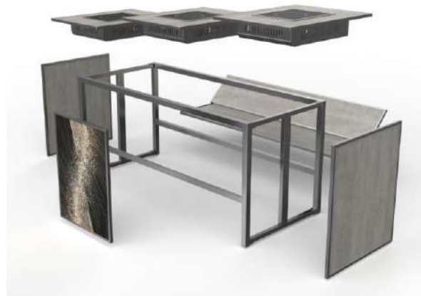
组合示意图/Schematic Diagram of Combination