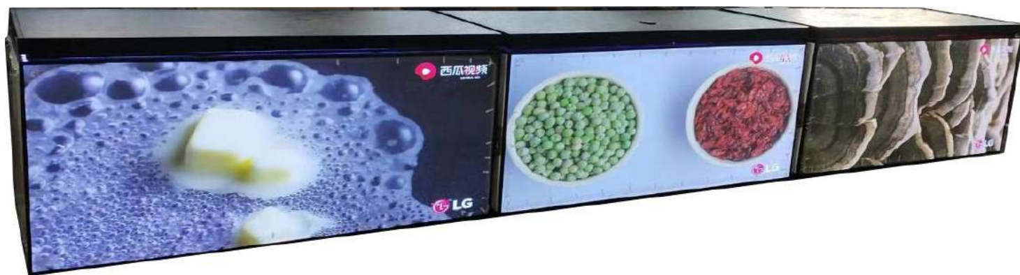
挂屏布菲车/Hung screen Buffet