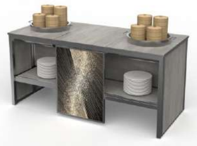
点心车/Dim Sum Station