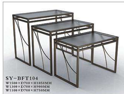
SY-BFT104 W1500×D700×H1050MM W1300×D700×H900MM W1100×D700×H750MM